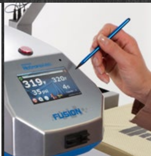
TOUCH SCREEN DISPLAY WITH STYLUS

Standard on the Hotronix® FUSION® family of heat presses, digital touch screen technology provides accurate, easily-adjustable time, temperature, and pressure settings. It also allows users to program and store settings for frequently-used applications.