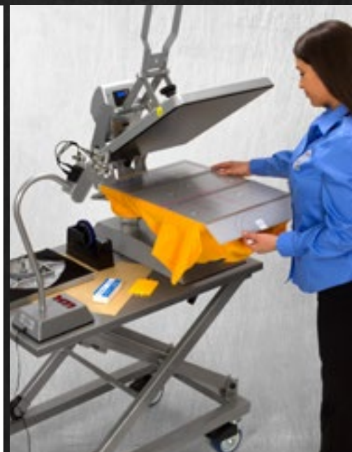
EQUIPMENT CART - LASER ALIGNMENT SYSTEM

The Hotronix® Heat Press Caddie™ Stand can be adjusted up to 40", while self-leveling casters provide portability and stability around your workspace. It also provides Threadability™ to your Hotronix® clam-style press .