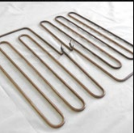
HOTRONIX® HEATING ELEMENT

Hotronix® heat presses come in a variety of sizes that fit any business's needs. Whether it's a space-saving clam style, the heat-free workspace of a FUSION® , the Dual Air FUSION's two separate workstations, or a cap press, there are options designed for any shop on any budget.