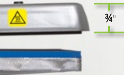
SOLID 3/4" PLATEN