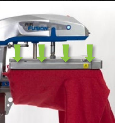
AIR FUSION® - AUTO ADJUST PRESSURE™

Platens on Hotronix® heat presses are built solid using 3/4" cast aluminum. This extra thickness and weight retains heat longer for reliable, consistent heat printing.